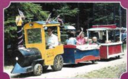
FREE Miniature train ride around the lake.